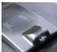
2 LOCKABLE LIDS