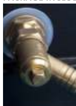
DRAIN OFF POINT