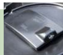
2 LOCKABLE LIDS