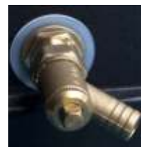
DRAIN OFF POINT