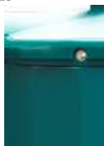
FULLY REMOVABLE COVER FOR CLEANING